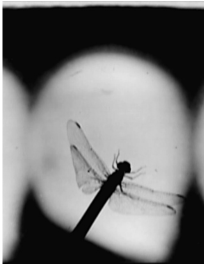
Figure 1.3 Marey's dragonfly, produced and photographed by Etienne-Jules Marey, 1891.

for later animators and helped prepare their audiences for diverse spectacles and increasing uses of moving, drawn images. Variations on the mutoscope would later become a useful tool for animators previewing and testing their sketches for fluid motion and accuracy.