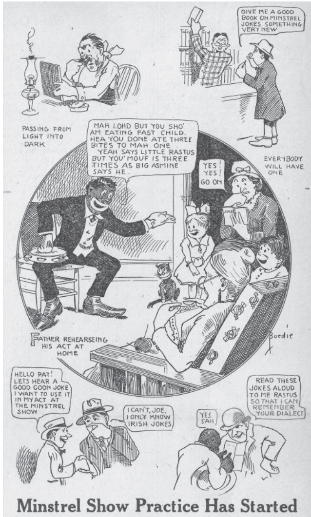
Figure 1.7 “Minstrel Show Practice Has Started.” Wingfoot Clan (January 13, 1917): 3, Goodyear Collection.

How does this image reinforce the idea that there was a global racial hierarchy, at least in the eyes of Goodyear executives, who permitted this cartoon in the company newsletter and opened the Goodyear Theatre to minstrel shows?