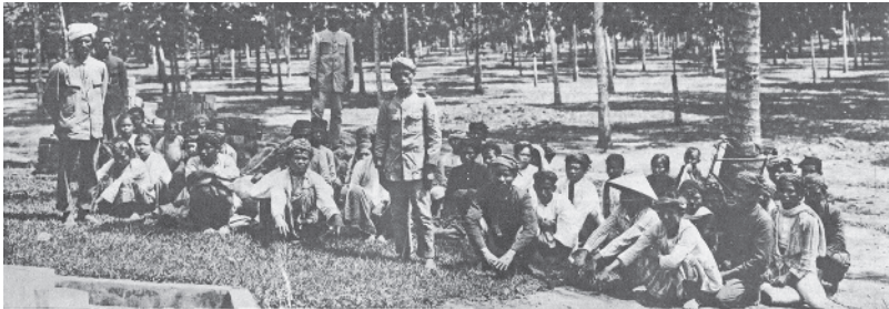
Figure 1.5 “A Group of Newly Arrived Javanese Laborers.” Wingfoot Clan (March 8, 1919): 8, Goodyear Collection.

What do these two photos tell us about those employed on Goodyear plantations? Which group was called “labor” and which “staff”? Which were “employees” as opposed to “laborers”? Is it significant that one group crouches while the other stands for a photograph? Can you imagine which received pensions when they retired? How was the hierarchy of the plantation easily visible to all who worked on one?