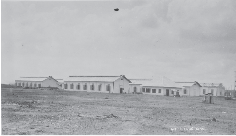
Figure 1.6 Plantation workers' barracks at Goodyear Wingfoot Estates. Photograph (42dw) dated January 15, 1935.

Initially, plantations had rudimentary "coolie lines" or barracks, which improved in construction quality over time. This image shows Goodyear laborers' barracks from the 1930s. Even then several had no rooms or partitions, serving instead as huge dormitories for male workers.