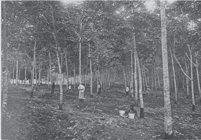
Figure 1.1 Tapping Rubber Trees. From Firestone, Rubber: Its History and Development (Akron, OH: Firestone, 1922), p. 15.

Describe the arrangement of trees. How could symmetrically spaced trees (all planted at the same time and thus the same size) suggest order, efficiency, modernity, progress, and the “West” in an area that had been a “disorderly jungle”?