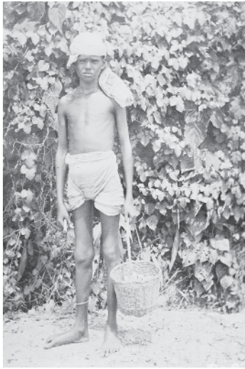
Figure 1.2 Boy on Plantation: “Native Rubber Collector.” Photograph (2073) dated July 24, 1915, Goodyear Collection. Photo reprinted with permission of Archival Services, University Libraries, University of Akron.