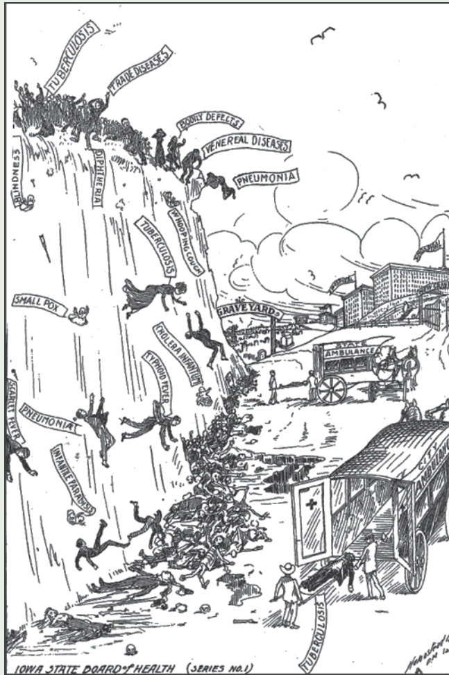
FIG. 2.— Illustrating the dangerous cliff without a fence.