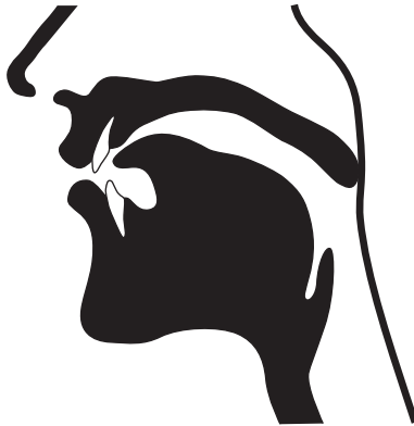
An alveolar sound: the first sound in sin

Sounds in which there is a constriction between the blade or tip of the tongue and the alveolar ridge are called alveolar sounds. An example is the first sound in sin .