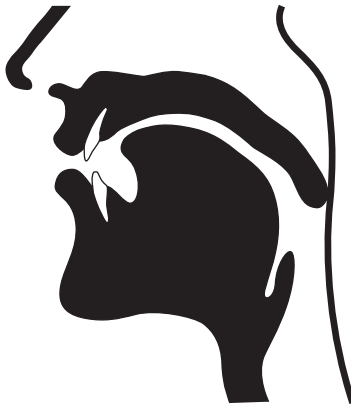
A palato-alveolar sound: the first sound in ship

Sounds in which there is a constriction between the blade of the tongue and the palato-alveolar (or post-alveolar) region are called palato-alveolar sounds. An example is the first sound in ship .