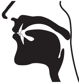
A bilabial sound: the first sound in pit

Secondly, sounds in which there is a constriction between the lower lip and the upper teeth are referred to as labio-dental sounds. An example is the first sound in fit .