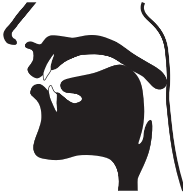
A velar sound: the first sound in cool

Sounds in which there is a constriction between the back of the tongue and the velum are called velar sounds. An example is the first sound in cool .