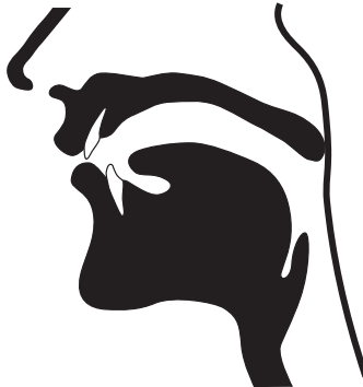
A labio-dental sound: the first sound in fit

Secondly, sounds in which there is a constriction between the lower lip and the upper teeth are referred to as labio-dental sounds. An example is the first sound in fit .