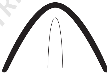
Open vocal folds

Speech sounds are made by modifying an airstream. The airstream we will be concerned with in this book involves the passage of air from the lungs out through the oral and nasal cavities (see Figure 1, page 00). There are many points at which that stream of air can be modified, and several ways in which it can be modified (i.e. constricted in some way). The first point at which the flow of air can be modified, as it passes from the lungs, is in the larynx (you can feel the front of this, the Adam's apple, protruding slightly at the front of your throat; see Figure 1), in which are located the vocal folds (or vocal cords ). The vocal folds may lie open, in which case the airstream passes through them unimpeded. Viewed from above, the vocal folds, when they lie open, look like this: