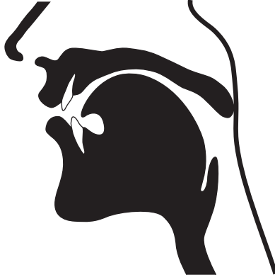
A palatal sound: the first sound in yes

Sounds in which there is a constriction between the front of the tongue and the hard palate are called palatal sounds. An example is the first sound in yes (although this may be less obvious to you; we will return to this sound below).