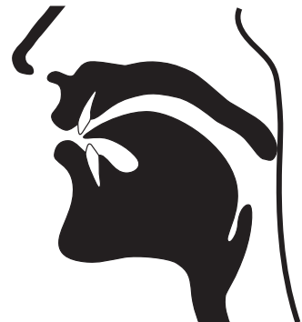
A dental sound: the first sound in thin

Thirdly, sounds in which there is a constriction between the tip of the tongue and the upper teeth are referred to as dental sounds. An example is the first sound in thin .