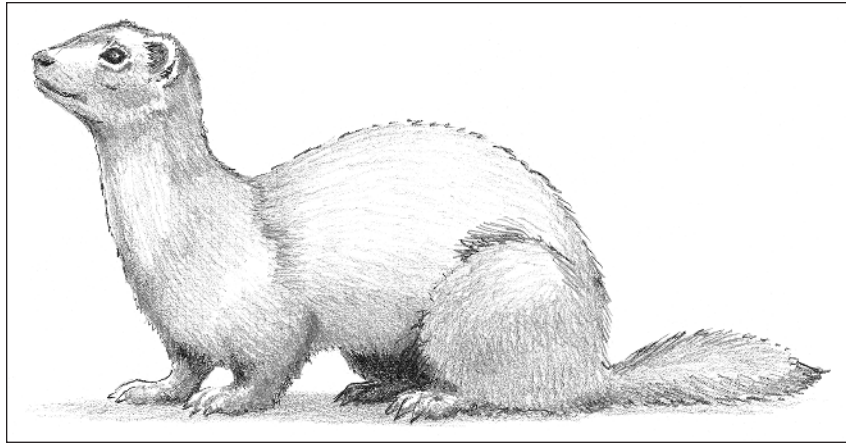
FIGURE 1-1: They may look like rodents, but ferrets are actually carnivores.