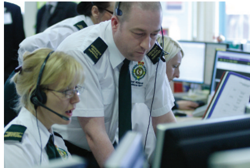
Figure 1.2 Ambulance control centre.